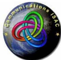
Communications ISAC http://www.ncs.gov