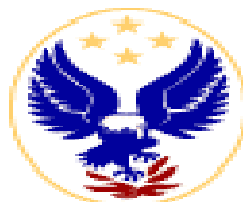
Emergency Management and Response ISAC http://www.usfa.fema.gov/fire-service/cipc/cipc-new.shtm

Special thanks and appreciation to the members of the Local Government Cyber Security Committee whose dedication and passion to this effort made this Guide possible: