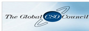
The Global Council http://www.csocouncil.org/